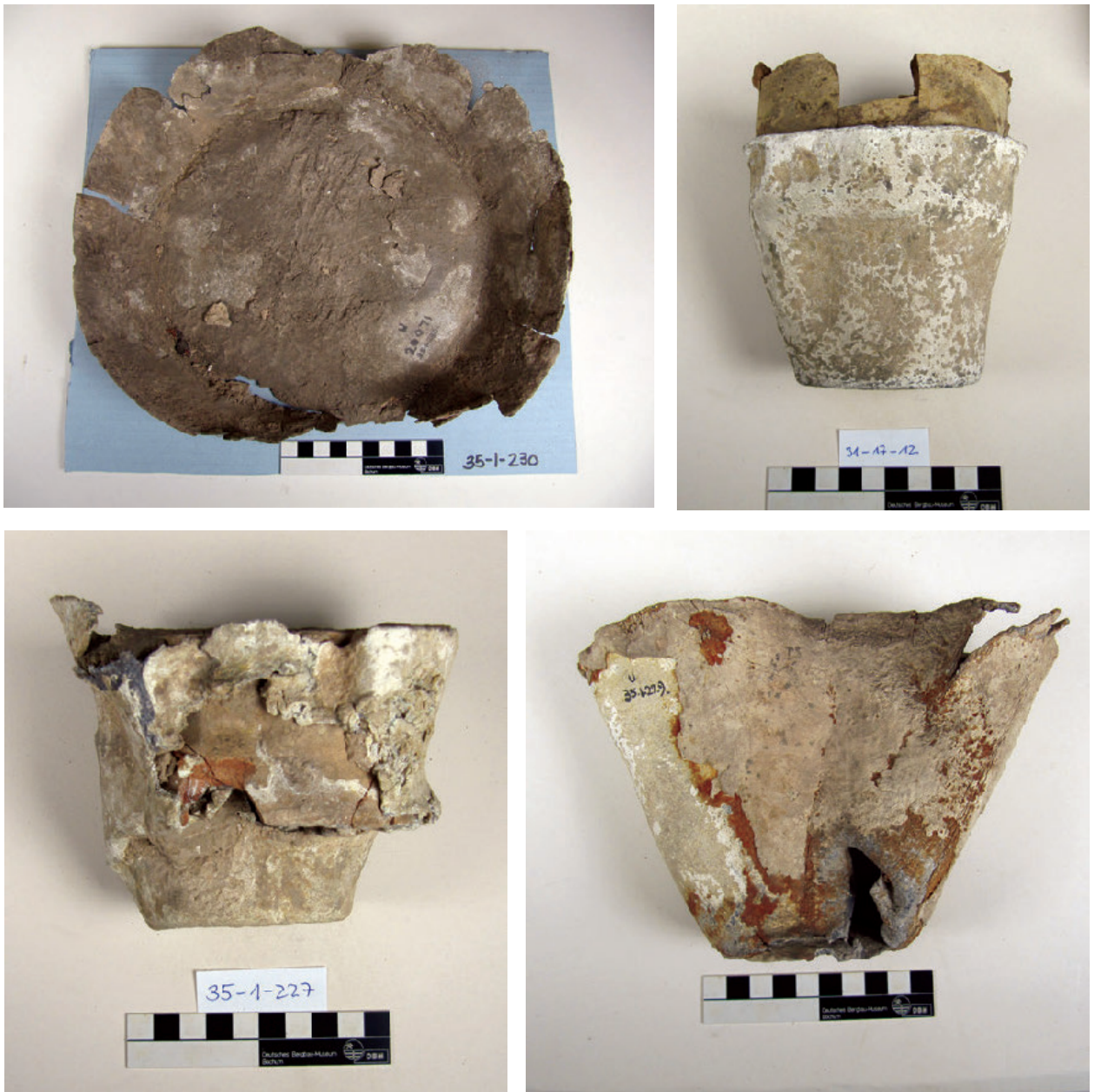
Figure 1. Lead metal sheets used to cover small ceramic cups. The first one is flattened. (Penn Museum collection, Pictures taken by A. Hauptmann and S. Klein).

chemical ICP-MS in Bochum (DBM) and lead isotope analysis in Frankfurt am Main (Geochemistry laboratory of the Goethe University).