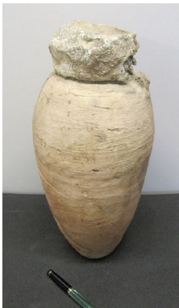
Figure 2. Lead wrapped-seal on a jar from Ur, Birmingham Museum.

and phosphorus are present, but statistically variable (heterogeneous) in concentration. As for the other elements, tin is individually high in the silver-rich cup (500 ppm Ag) with 220 ppm Sn, all others contain tin in the low ppm-level only. Concentrations of nickel and zinc are detected in low ppm-level.