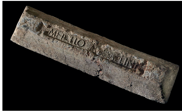
Figure 2. Lead ingot with unknown provenance. The inscription metallo Messallini says that it was produced in the mines of Messallinus.

The second specific feature, the ansate panel, again can be observed on the two ingots from southern Serbia, but also on one of the ingots from Derbyshire (RIB II.1, 2404.40), furthermore on two ingots from the Mendips (RIB II.1, 2404.17-18) and on three ingots found in Caesarea Maritima (CIIP 1382-1384, originating from Dalmatia). The ansate panel of the Messallinus ingot shows the closest similarities to the Augustan ingots from southern Serbia. Based on these epigraphical and typological considerations, the place of production was possibly in southern Serbia or its neighbouring regions. What is