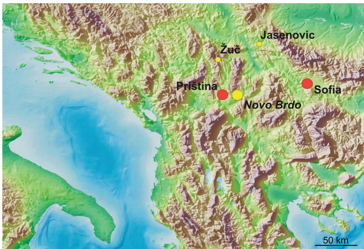
Figure 1. The lead ore deposit of Novo Brdo (Kosovo) and find locations of Augustan lead ingots in the western Balkan region (yellow dots) that are significant in this study.

revolt in AD 6 he achieved important victories over the insurgent tribes. The mines were likely a gift from Augustus (who owned mines in that region) to Messallinus for his deeds. The shape of the panel and the inscription on the ingot as well as lead isotope analysis suggest an origin in the ore regions of Serbia and the Kosovo. According to the isotope comparison, the mines were located in the district of today's Novo Brdo in eastern Kosovo (Figure 1).